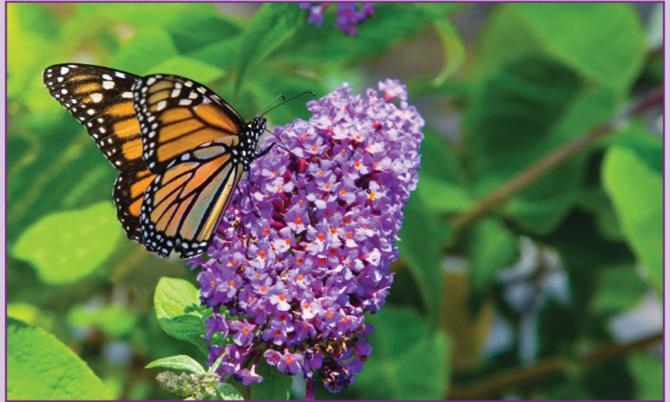
Monarch butterfly on the flower of a Butterfly Bush.

Make your garden more attractive to butterflies by creating a habitat that meets all of their needs.